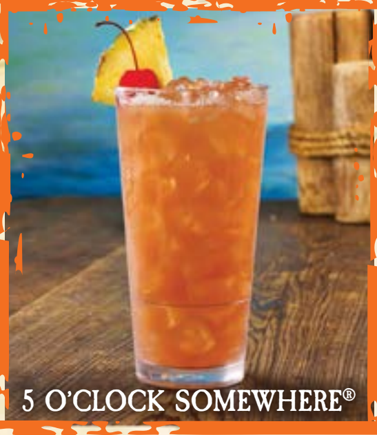
5 O'CLOCK SOMEWHERE®

This cool blue concoction of Cruzan® Mango Rum, Bols® Blue Curaçao, pineapple juice and mango. Served on the rocks