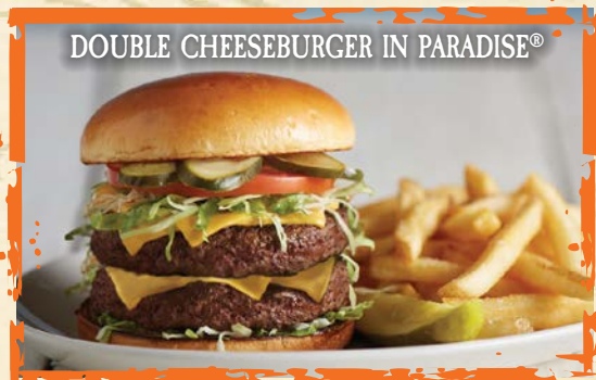
DOUBLE CHEESEBURGER IN PARADISE®

Shredded iceberg lettuce, seasoned ground beef, cheddar and Monterey Jack cheese, diced tomatoes, black beans, diced cucumbers, roasted corn and avocado tossed in ranch dressing, topped with crispy tortilla strips, queso fresco and cilantro. Served with fresh guacamole and sour cream (1330 calories)