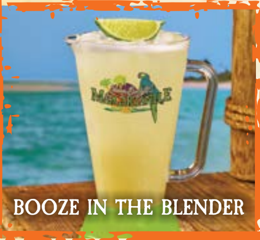
BOOZE IN THE BLENDER

Margaritaville Silver Tequila, Bols® Blue Curaçao and our house margarita blend. Served on the rocks